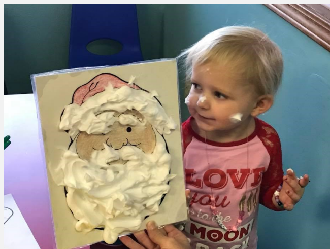
Sensory Learning with shaving cream