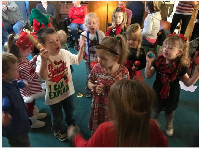
Jingle Bells with our musical instruments