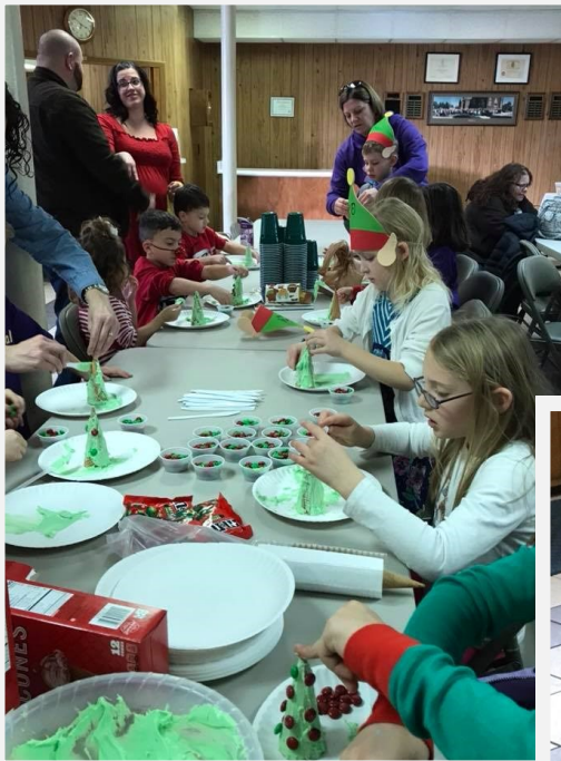
A visit from Santa and making Christmas trees from ice cream cones!

Sharing a few pictures from the fun the children had at their Christmas Party on the afternoon of December 10.