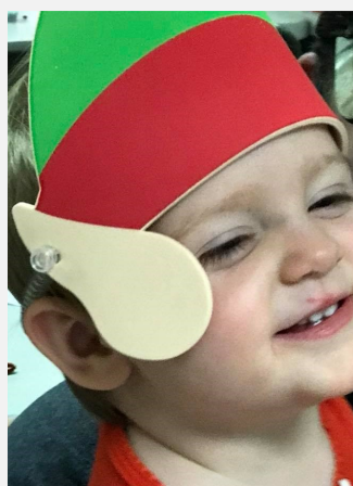
Ho Ho Ho and a little elf!