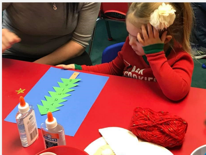
Learning out name while making a Christmas tree.