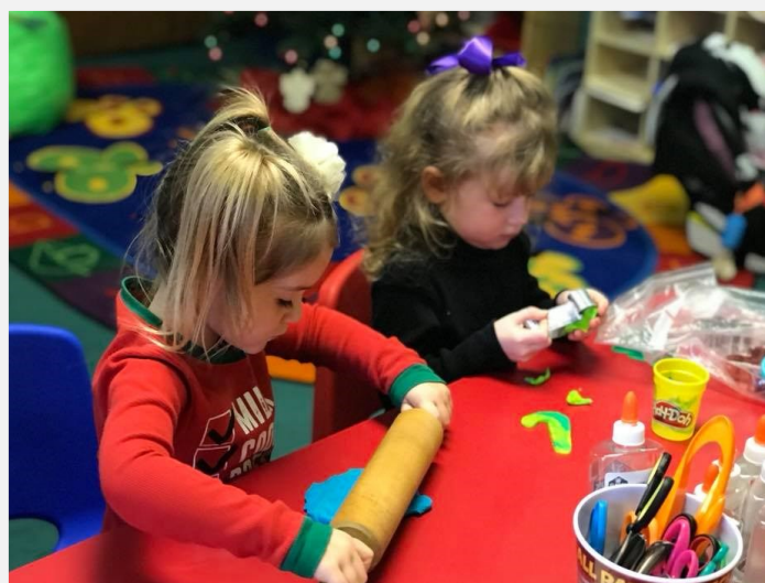
Making pretend Christmas cookies