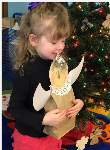
Following directions to make an angel and Santa