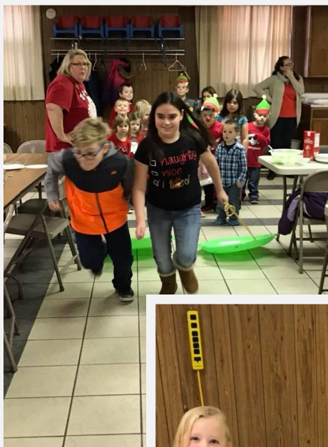
Sled races and cookie decorating!