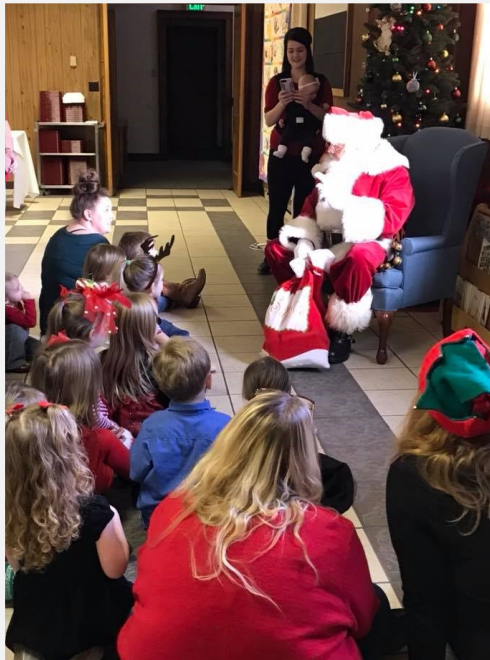
A visit from Santa. He showed us some of his magic!